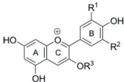
Figure 1. Chemical structure of anthocyanins-3-O-glucoside (Martín et al., 2017)

Regarding the chemical structure of anthocyanins, they are glycosylated polymethoxy or polyhydroxy derivatives of 2-phenylbenzopyrilium, with two benzyl rings (noted with A and B) as seen in Figure 1.