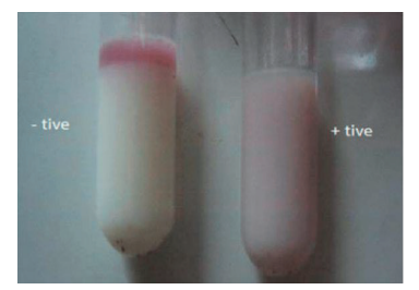
Figure 3. Milk ring test (MRT) result

The Rose Bengal Test results showed that of the 250 samples collected from the Basra area, 27 of them, representing 10.8%, were positive (Table 6).