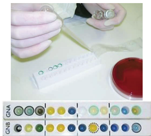
Figure 1. Microgen Bacillus-ID identification system

One of the materials used was Microgen Bacillus-ID (MID-66), a miniaturised biochemical identification system designed to identify those Mesophilic Bacillus spp. and related genera associated with food and beverage spoilage and food poisoning. The method uses classical biochemical substrates modified in such a way that they can be employed for the identification of these organisms. The Microgen Bacillus -ID identification system consists of 2 microwell test strips (labelled BAC 1 and BAC 2), each containing 12 dehydrated substrates for the performance of either carbohydrate fermentation tests or other biochemical based tests. The last well in the second test strip is a carbohydrate fermentation control well for use as a reference well in the interpretation of these tests. The selection of the substrates included in the test panel has been determined using computer based analysis of all available substrates for the identification or differentiation of this group of organisms.